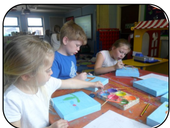
Art & Craft